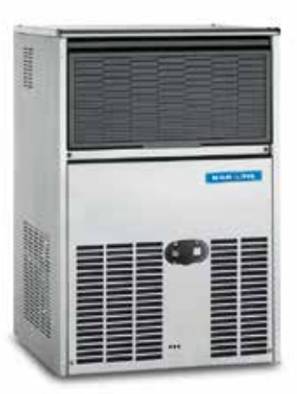
B 4015 AS/WS

Bar Line Equipment range is the newly released EU made ice makers for Thimble-shaped rounded ice cubes coming from Bar Line.